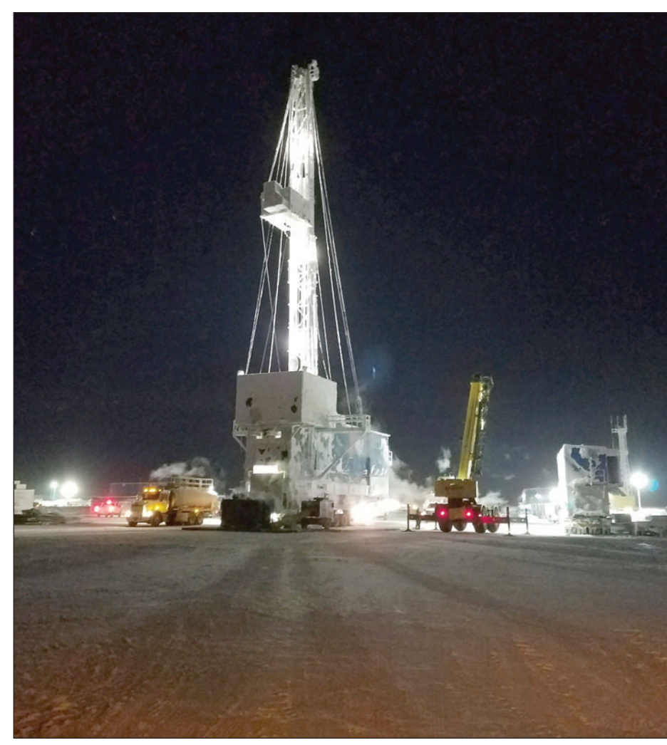
Rig-111 commissioning work, in January 2021 for Merlin 1.

APDC, a Delaware limited liability corporation formed late last year for investment in Project Peregrine, has not yet posted the names of its members. It did issue the following statement regarding the sale to 88 Energy, which was included in the June 7 ASX release: "We are very proud of the important role that we played in the drilling of Merlin 1 and the initial exploration program at Project Peregrine. However, we also recognize that we are unlikely to be able to satisfy